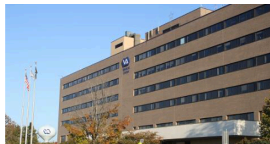
Martinsburg VA Medical Center 510 Butler Avenue Martinsburg, WV 25405-9990 800-817-3807

Citation to the Outstanding Hospital Volunteer of the Year in each of the 10 Program Divisions. Entry form required available on MALTA Member Resources. Citations to be mailed directly to winners from National Headquarters after the 2026 VFW Auxiliary National Convention.