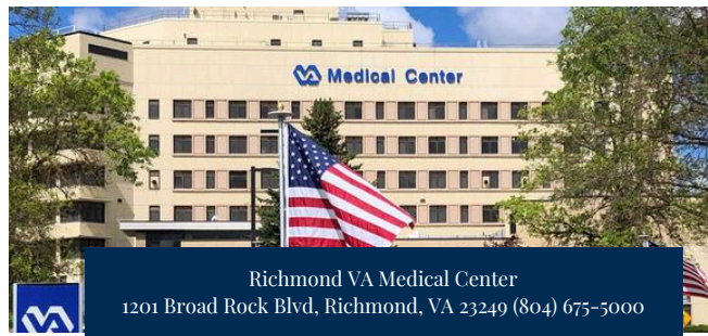
Richmond VA Medical Center 1201 Broad Rock Blvd, Richmond, VA 23249 (804) 675-5000