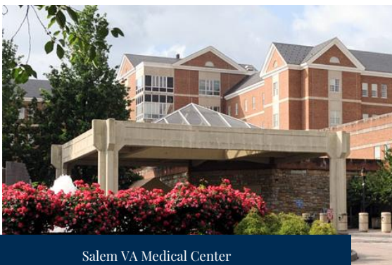
Salem VA Medical Center 1970 Roanoke Boulevard, Salem, Va 24153 (540) 9822463

When we come together, our combined strength creates a force for good that is truly unstoppable. Through collaboration, sharing ideas, resources, and heartfelt dedication, we multiply the warmth and hope delivered to those who have served. It is this unity, this spirit of partnership, that leads to real victories: not just in major achievements, but in the everyday support and encouragement offered to veterans and each other. Working side by side, united in gratitude and purpose, we build a legacy of service that resonates across generations, showing that our greatest triumphs are born from standing together and lifting every voice in support of those who sacrificed for our nation.