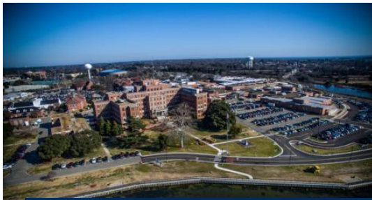
Hampton VA Medical Center 100 Emancipation Drive, Hampton, VA 23667 (757) 722-9961

When we come together, our combined strength creates a force for good that is truly unstoppable. Through collaboration, sharing ideas, resources, and heartfelt dedication, we multiply the warmth and hope delivered to those who have served. It is this unity, this spirit of partnership, that leads to real victories: not just in major achievements, but in the everyday support and encouragement offered to veterans and each other. Working side by side, united in gratitude and purpose, we build a legacy of service that resonates across generations, showing that our greatest triumphs are born from standing together and lifting every voice in support of those who sacrificed for our nation.