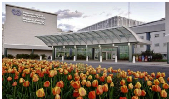
Washington VA Medical Center 50 Irving Street, Northwest Washington, DC 20422-0001 202-745-8000

Many Auxiliary members in nursing homes can assist with our programs. I'm sure they'd love to still be active in our organization even though they can no longer travel to meetings or events. Maybe volunteer to do a monthly knitting circle, host a movie night or other projects/events at a nursing home. Veterans, Auxiliary members and others in the home can participate. Remember to think outside the box when volunteering at a VA facility, nursing home or hospital. Everyone will gain so much from the experience.